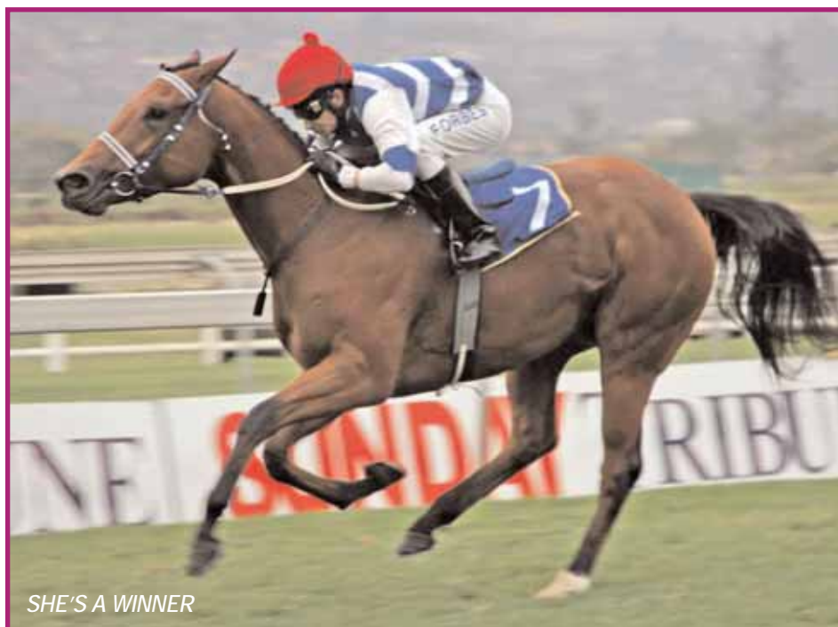
SHE'S A WINNER