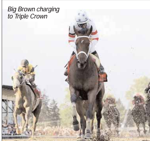
Big Brown charging to Triple Crown

"An armchair ride and a push-button," said Desormeaux, who added that he began looking for competition "at about the half-mile pole".