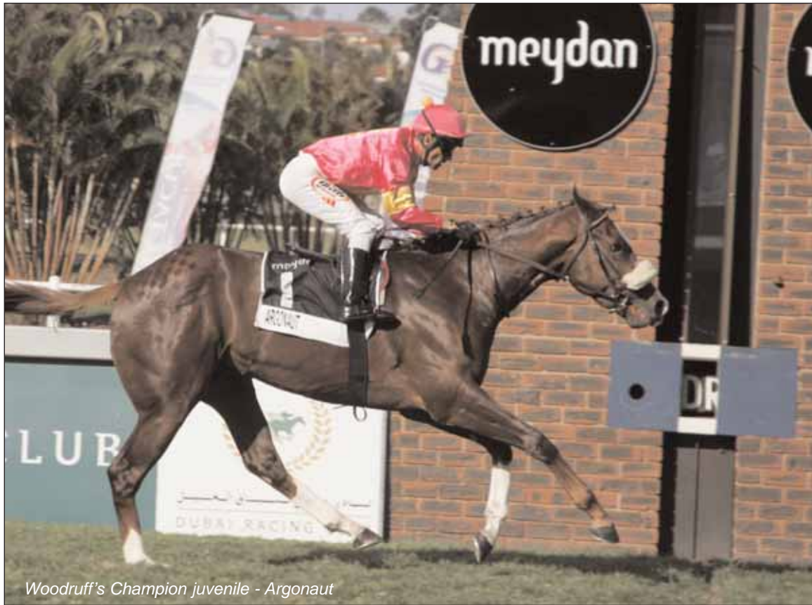
Woodruff's Champion juvenile - Argonaut

"We thought the Championships would be decided at the big meeting on Saturday and if we knew it was going to come down to this we