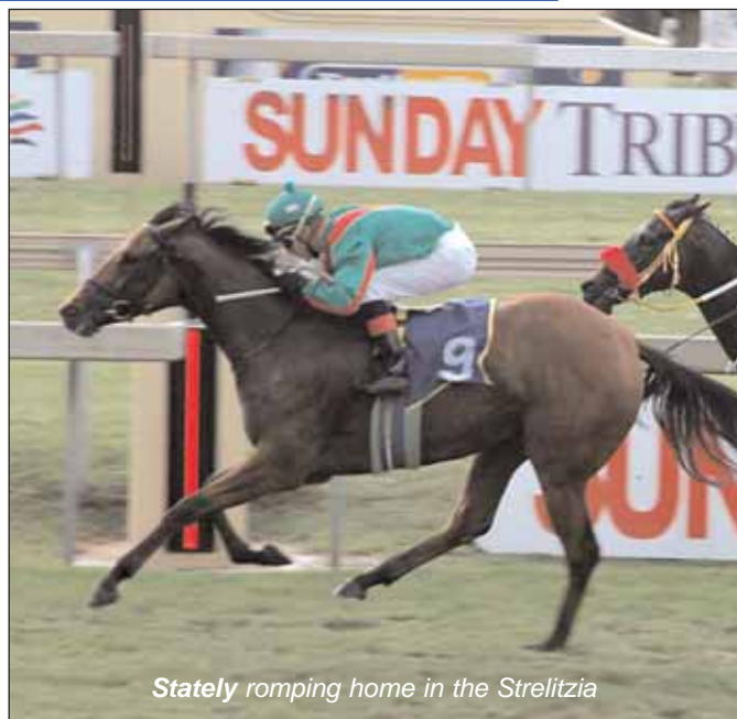
Stately romping home in the Strelitzia