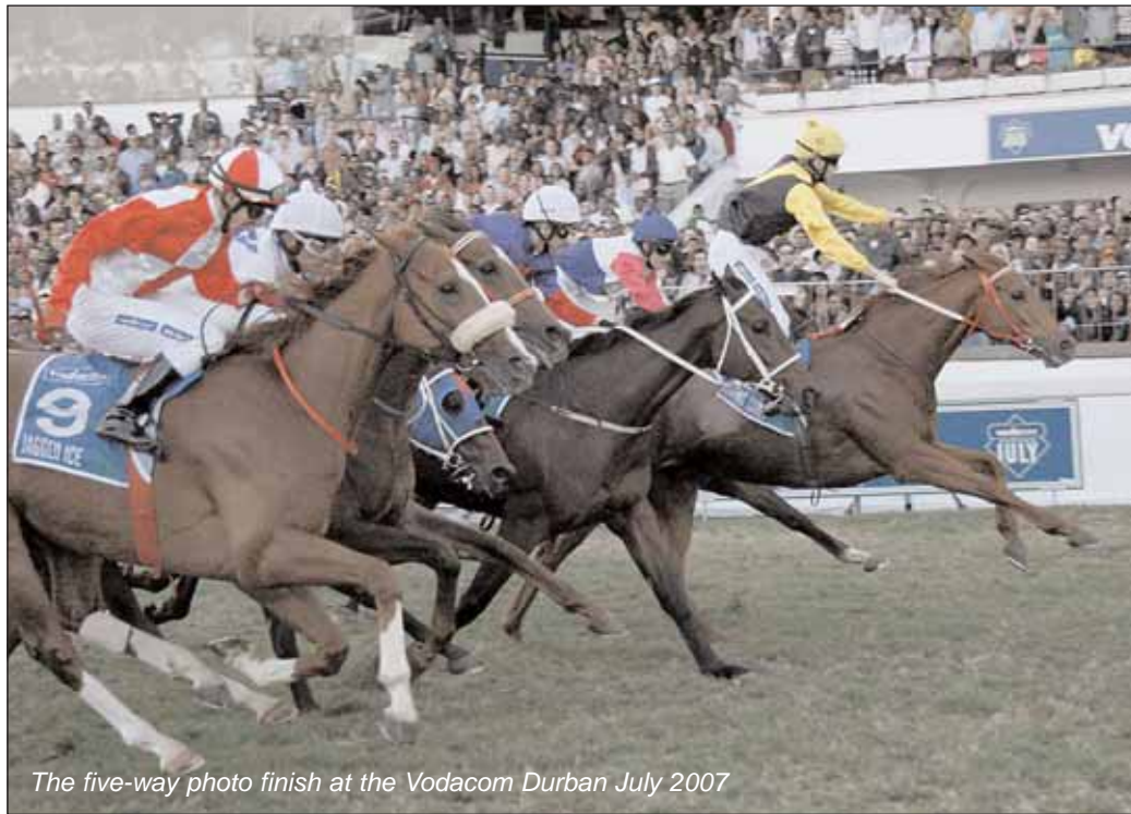
The five-way photo finish at the Vodacom Durban July 2007