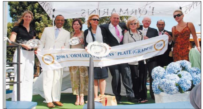
Happy days... the Queen's Plate.