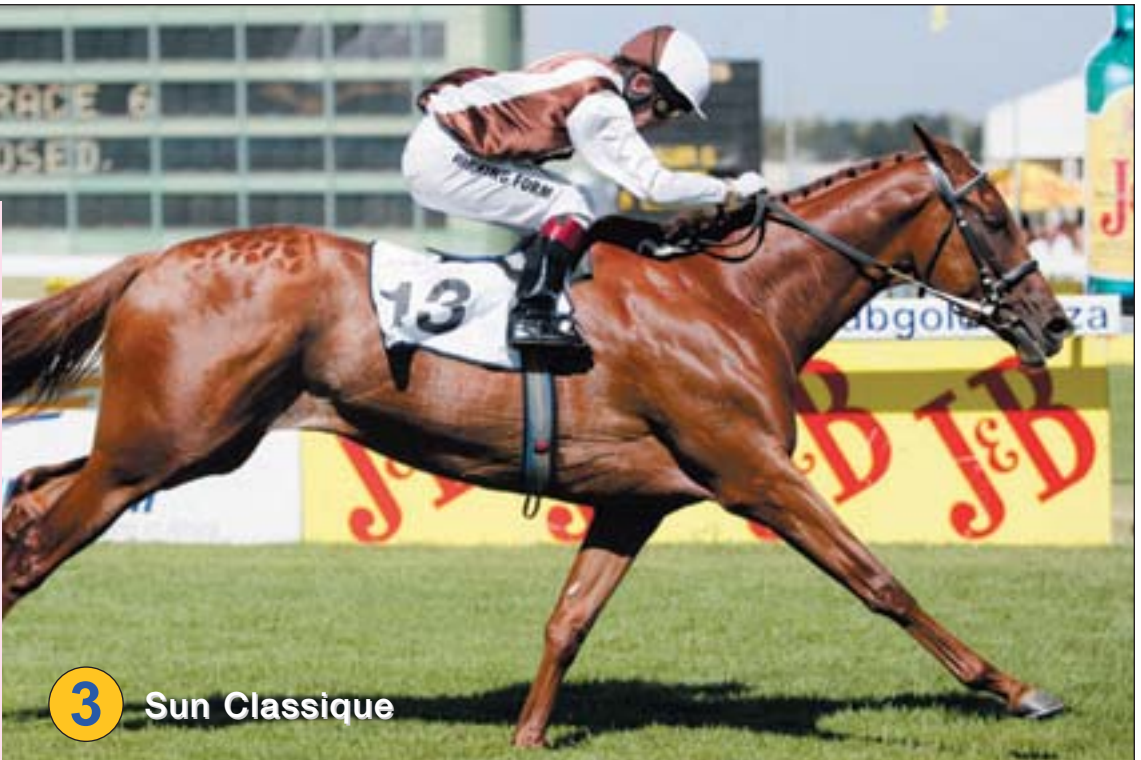
3 Sun Classique