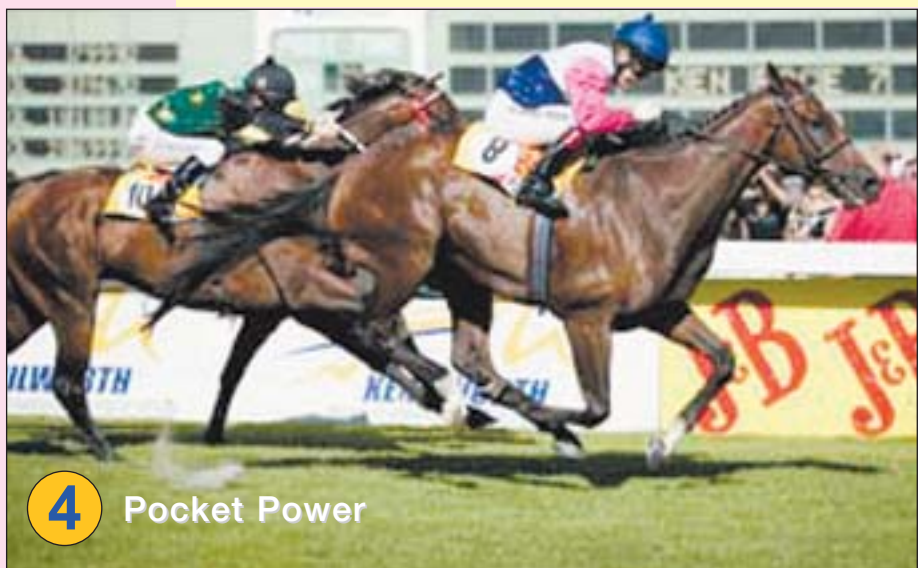
4 Pocket Power

The crowds flocked to the course on the day after waking up to a typically glorious Cape summer's day.