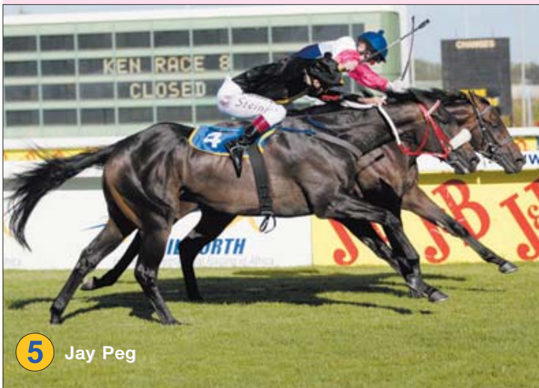
5 Jay Peg

The pace was as expected, a good one. The top Gauteng hope, the Geoff Woodruff-trained Elusive Fort, lay in third, ahead of Majestic Sun, Likeithot, Successful Bidder and