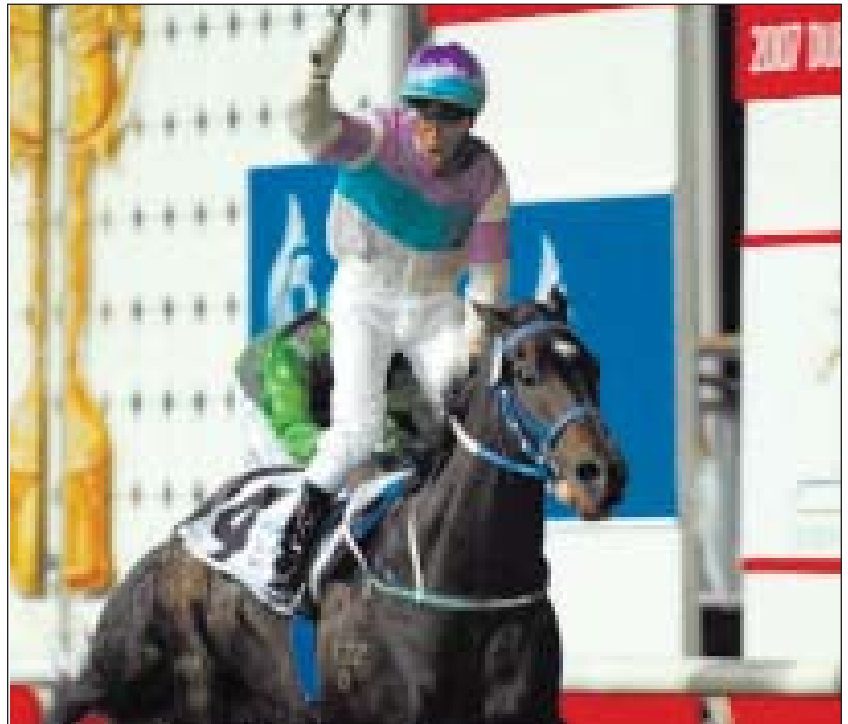
Vengeance of Rain ... won the US$5 million Dubai Sheema Classic (Gr.1), the most valuable turf race over 2400m on the planet.

Ferraris added Vengeance Of Rain would next strive for a second victory in the Audemars Piguet QEII Cup (Gr.1-